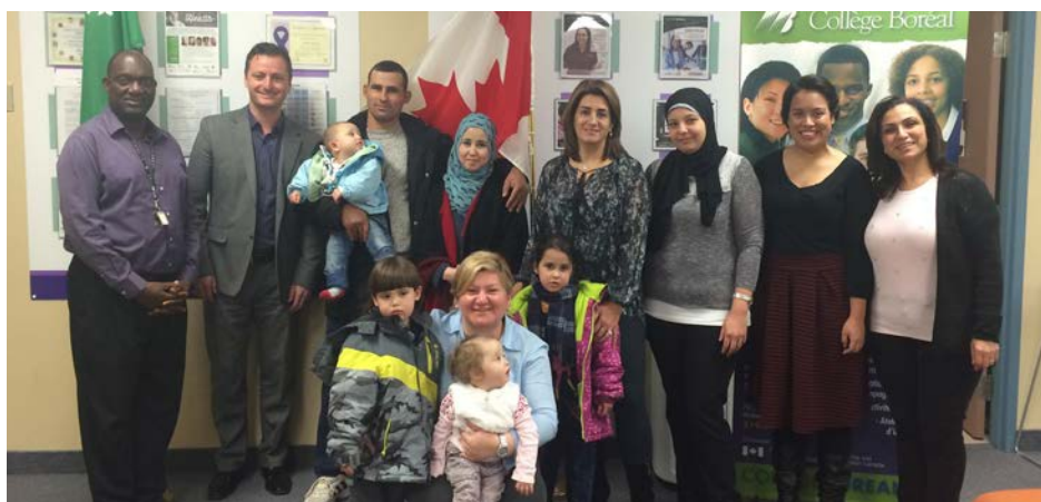
French-speaking Syrian refugees at Collège Boréal's Windsor site