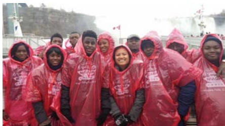
Students from Collège Boréal's Toronto campus visit Niagara Falls

The Student's Association (AGEE) works to represent and promote the interests of the students as well as to promote Franco-Ontarian culture in Collège Boréal's campuses and access centres across the province.