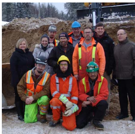
Participants enrolled in the Heavy Equipment Training program, Iroquois Falls, December 2015

Partnership with the Municipality of Iroquois Falls. The town of Iroquois Falls and Collège Boréal entered into a partnership agreement allowing community members to gain professional skills in order to re-enter the workforce. Participants enrolled in the Heavy Equipment Training program with the support of the Labour Action Adjustment Centre and the CDSSAB Employment Services Centres in Cochrane and Iroquois Falls. Since the town's landfill site required some maintenance, the municipality invited Collège Boréal to use the location as part of the practical component of the training course.