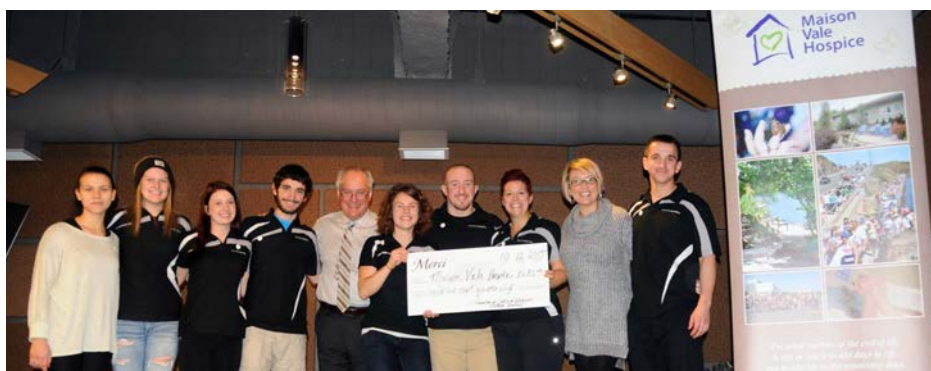
On December 10, 2015, Collège Boréal's Fitness and Health Promotion program, in partnership with La Fondation, organized a fundraiser to create a bursary for students enrolled in the program. Through the Adieu les ch'veux campaign and silent auction, La Fondation donated a cheque for $1,680 to Maison VALE Hospice.